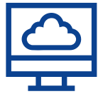
Software & Cloud